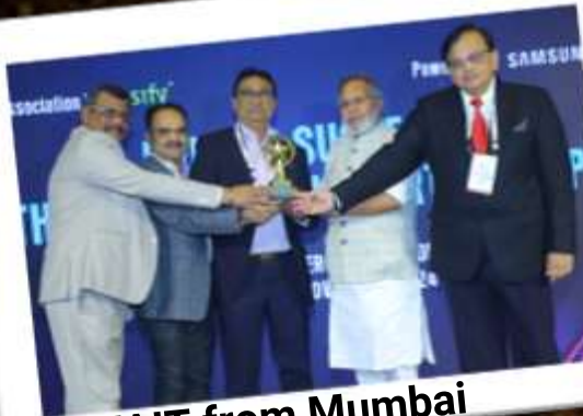
TAIT from Mumbai