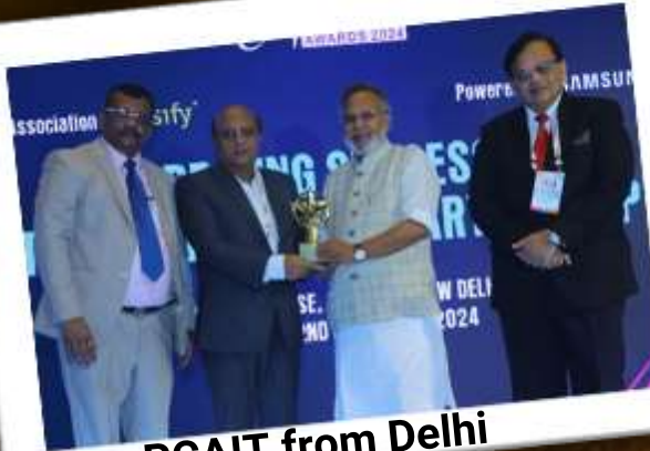
PCAIT from Delhi