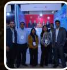
DELL TECHNOLOGIES | IRIS GLOBAL