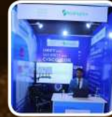
REDINGTON | CISCO