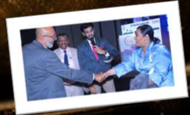
Photo Gallery: https://www.varindia.com/gallery/sna-2024