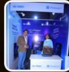
INGRAM | WINDOWS 11