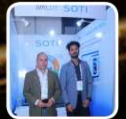
IVALUE | SOTI