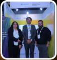
INTENSITY | HPE