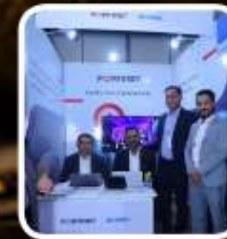
FORTINET | INGRAM